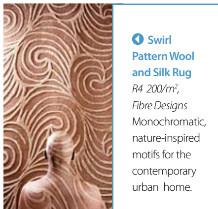
Swirl Pattern Wool and Silk Rug R4 200/m 2 , Fibre Designs Monochromatic, nature-inspired motifs for the contemporary urban home.

The cork flooring industry has undergone great change in the last few years. Technological breakthroughs in engineered and pre-finished products and the use of state-of-the-art resins to create cork flooring of unprecedented performance and attractiveness ensure that the more and more people are choosing floating cork flooring for their homes. Enquire about cork flooring at any flooring specialist or visit Africork.