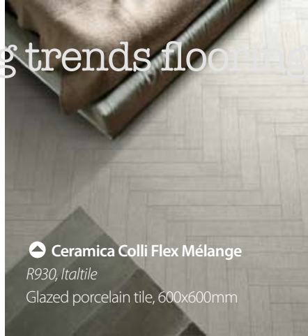
Ceramica Colli Flex Mèlange R930, Italtile Glazed porcelain tile, 600x600mm

Quartz Carpet's (pictured left) seamless stone flooring system provides the versatility and durability of quartz, yet is warm and soft underfoot. Quartz stone flooring is the most rapidly growing flooring system in the world. The seamless surface accentuates the natural beauty of the stone. Quartz stone flooring can also be paired with underfloor heating for added luxury. It's stain resistant, hygienic, and easy to maintain and keep clean. The practical uses of quartz stone flooring extend to soundproofing, as well as to stopping fires from spreading between different areas of your home. It's resilient surface and anti-slip texture makes it especially suitable for family bathrooms and swimming pool surrounds, though it heightens the loveliness of any room in the home. Interior designers and architects Kathy and Klaus Weixelbaumer comment: 'It's the only hard-wearing seamless floor you can lay in a pattern and in your chosen colours. It is a fabulous product, so versatile. It is a designer's dream.'